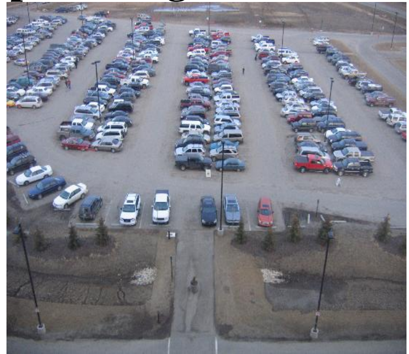
Huge Parking Areas