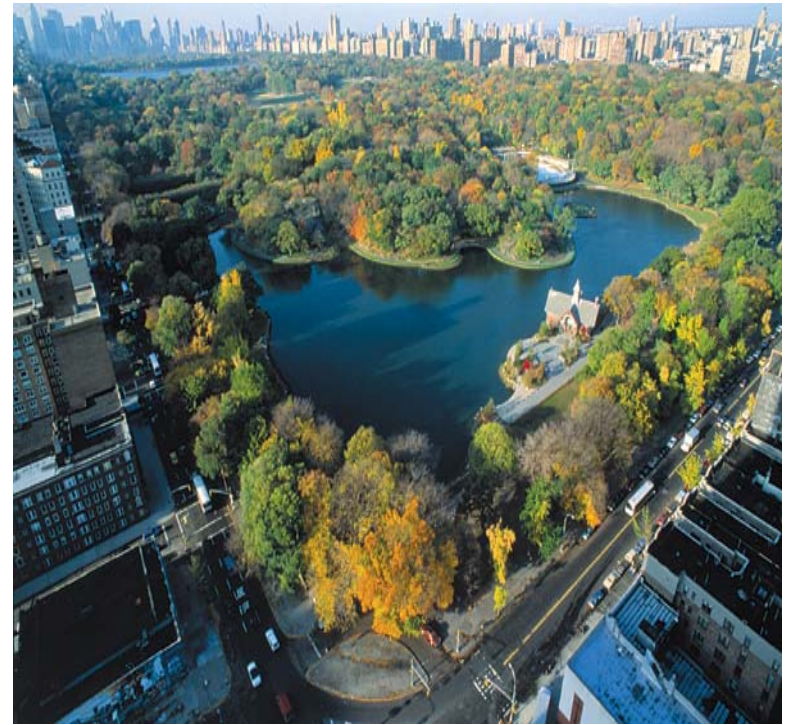
Central Park -1853