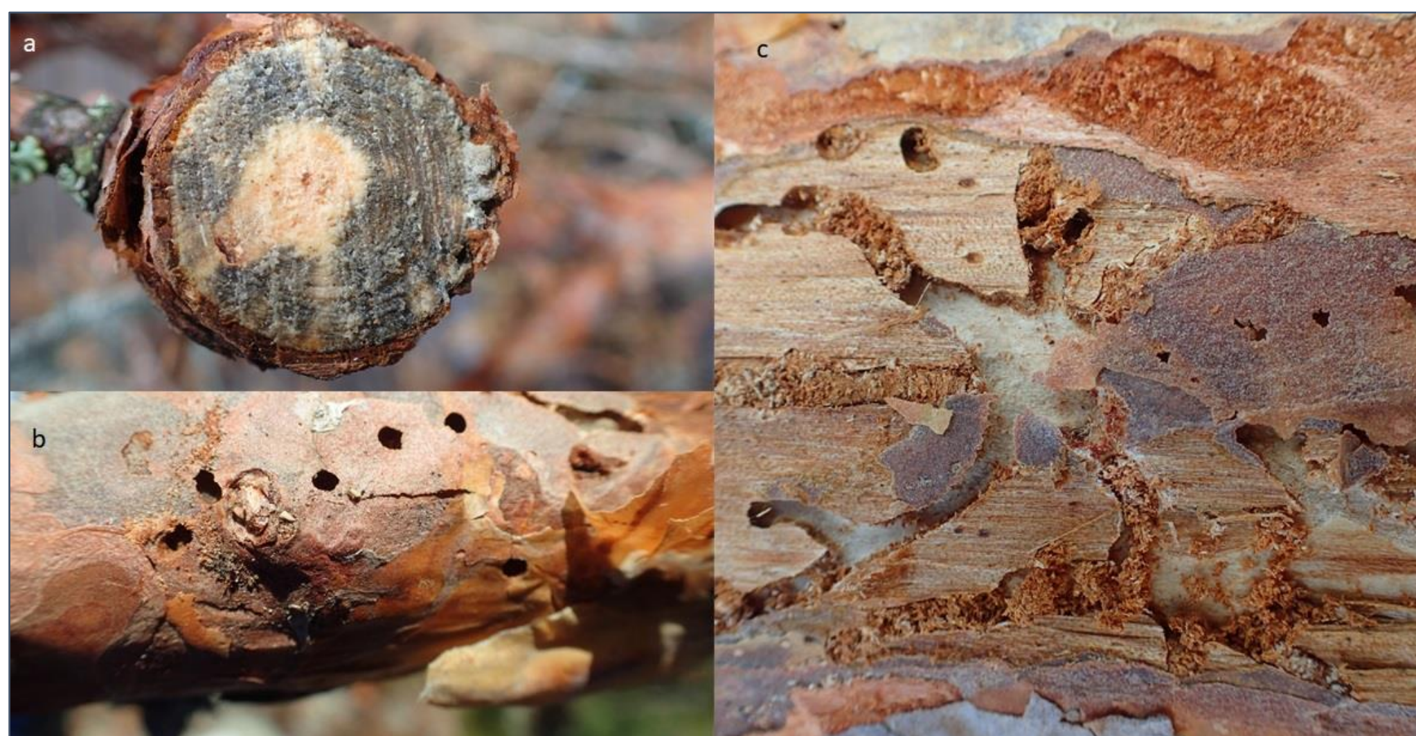
Figure 1: a) Ophiostoma clavatum stained Scots pine branch, b) entry holes made by Ips acuminatus , and c) galleries under the bark.

The blue stain Ophiostoma clavatum (Fig.1) is the most important disease vectored by the bark beetle Ips acuminatus (Linnakoski et al. 2016). In recent years Scots pine mortality in trees with I. acuminatus galleries has increased in Southern Finland and the alpine regions of Europe following a change in climate towards warmer and drier summers (Wermelinger et al. 2008; Siitonen 2014). In this study we wanted to examine if O. clavatum could contribute to tree death by assessing its pathogenicity with inoculation treatment of Scots pine seedlings in a controlled environment.